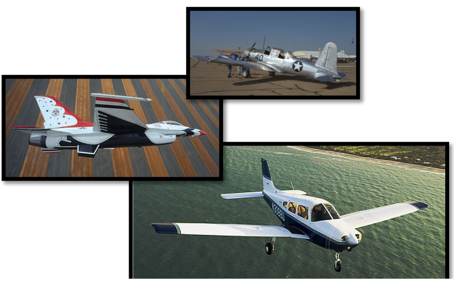
Example of picture layering

You can insert multiple graphics into your document and even overlap them if you remember to text wrap each of them with "tight". Then you can control which one is on top in the Arrange Group using Bring to Front, Send to Back, etc.